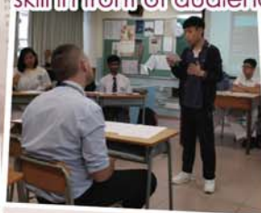
Students are working hard as a team