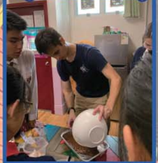
NET is preparing food for English Club meeting