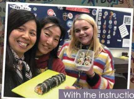
With the instructions of the Korean teachers, participants successfully made their Gimbap