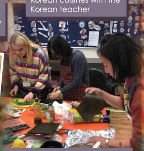
Korean Language and Culture Class is a cross-cultural activity conducted in English