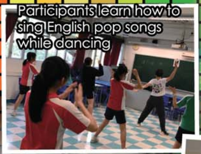
Participants learn how to sing English pop songs while dancing