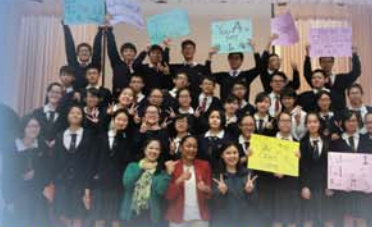
NET has given professional training to Choral Speaking Team