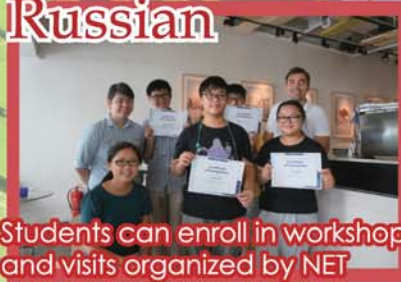
Students can enroll in workshops and visits organized by NET