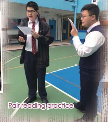
Pair reading practice