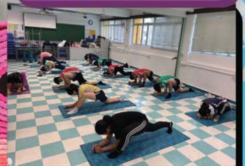
Stretching practice improves flexibility, strength and posture.