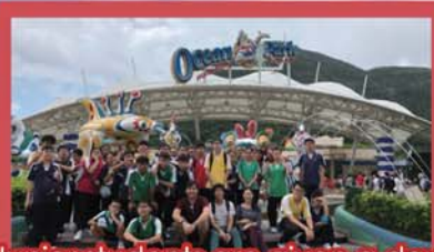
Junior students are given a day tour to Ocean Park with NET and English teachers during post-exam activity days