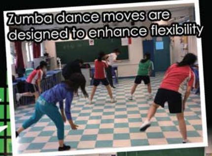
Zumba dance moves are designed to enhance flexibility