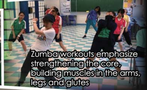
Zumba workouts emphasize strengthening the core, building muscles in the arms, legs and glutes