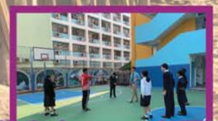
Students can meet NET to play basketball during recess and lunch time