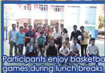
Participants enjoy basketball games during lunch breaks