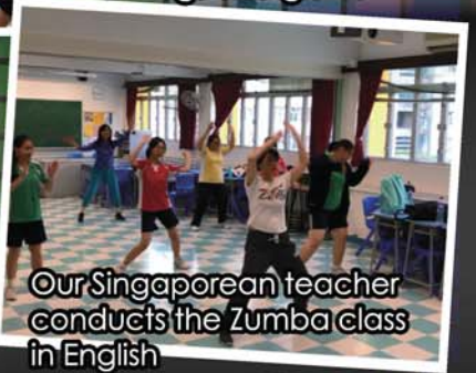
Our Singaporean teacher conducts the Zumba class in English