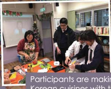
Participants are making Korean cuisines with the Korean teacher