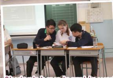
Students have learnt to work in high flexibility to improve their speech