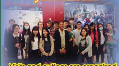
Visits and outings are organized regularly by NET