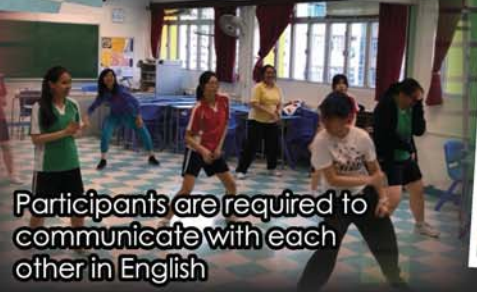
Participants are required to communicate with each other in English