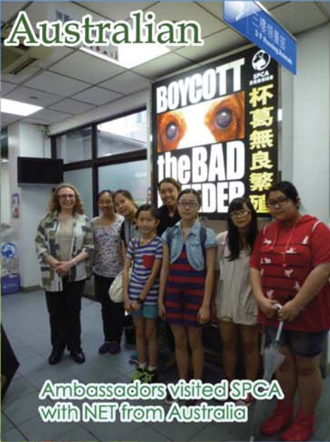
Ambassadors visited SPCA with NET from Australia