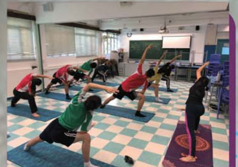
Following teacher's guidance, students can achieve their potentials.