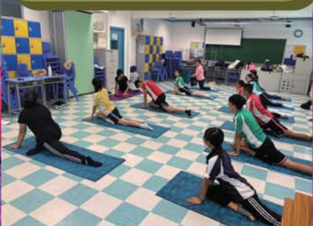
Teacher demonstrates and gives instructions in English.