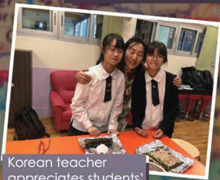
Korean teacher appreciates students' effort in learning a different language