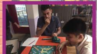
Students can meet NET during lunch break in the English Corner