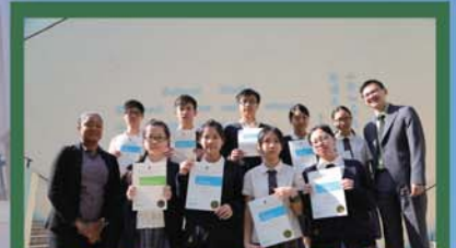
NET has provided training in annual Speech Festival