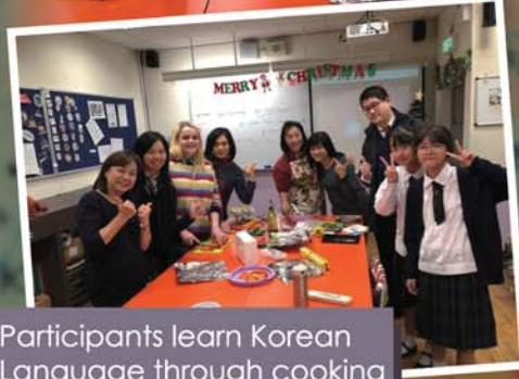
Participants learn Korean Language through cooking Korean food