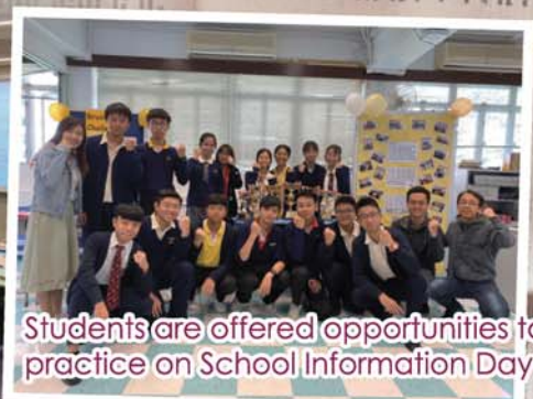
Students are offered opportunities to practice on School Information Day