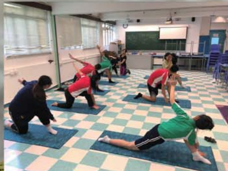
English is used as the medium of instruction in the class.