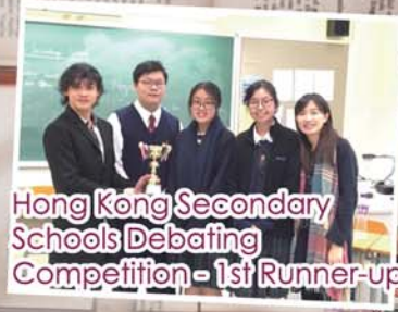
Hong Kong Secondary Schools Debating Competition - 1st Runner-up