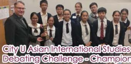
City U Asian International Studies Debating Challenge - Champion