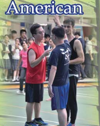
Our Principal and English teachers are invited to play with students