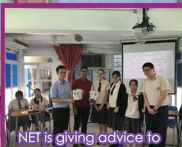
NET is giving advice to English Debate Team