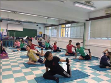
Despite the difficulty, participants are keen on doing the pose.