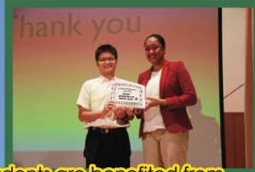
Students are benefited from participation in English Assembly