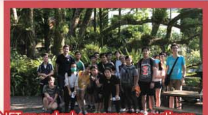
NET regularly arranges outings and visits for English Ambassadors