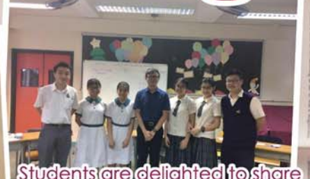
Students are delighted to share and gain valuable experience in debating competitions