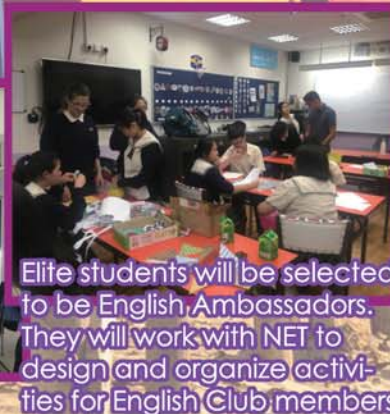
Elite students will be selected to be English Ambassadors. They will work with NET to design and organize activities for English Club members