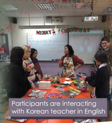
Participants are interacting with Korean teacher in English