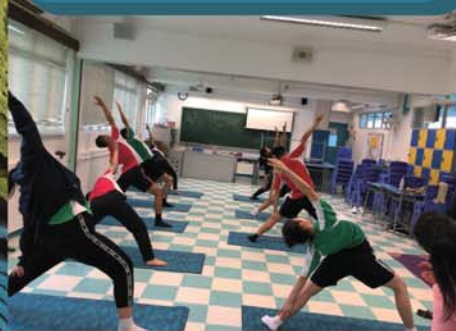
Regular stretching and active flow practice can improve respiration, energy and vitality.